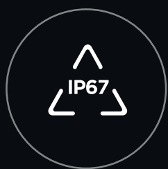
IP67 rugged design