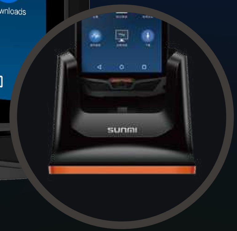
Opcional base cargador